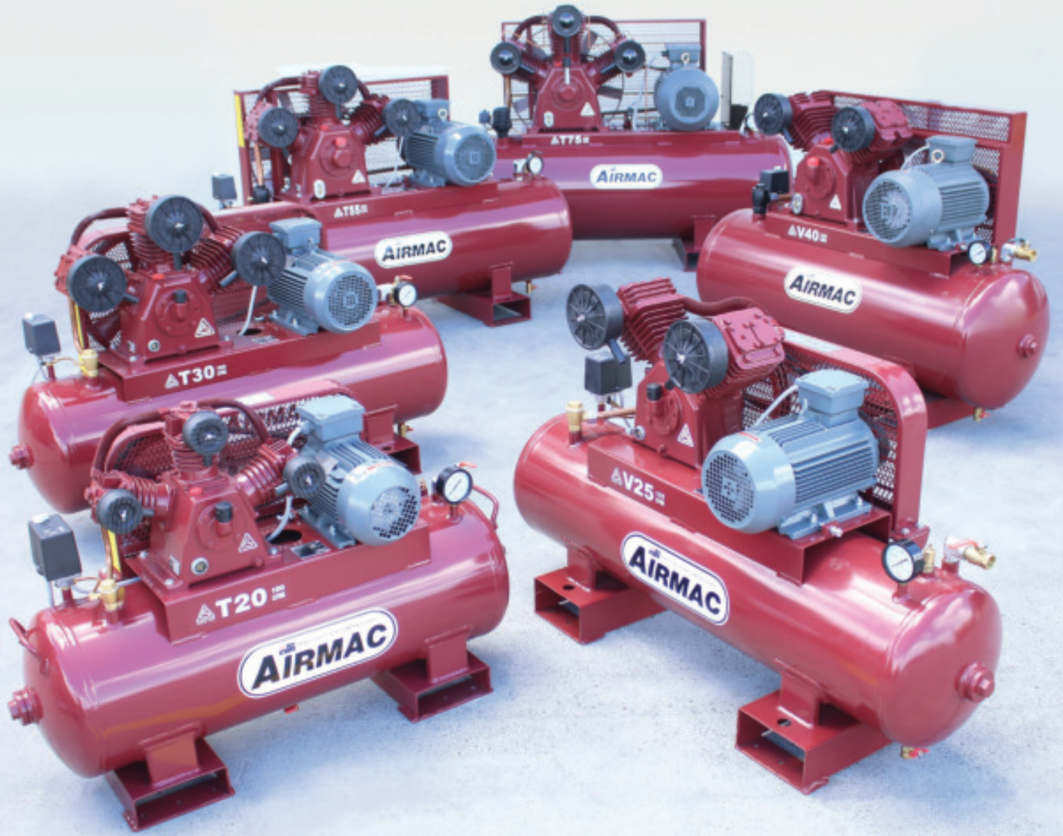
Standard Pressure Models Pictured