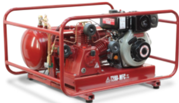
T20D MFC - 4.7 hp / 60 L