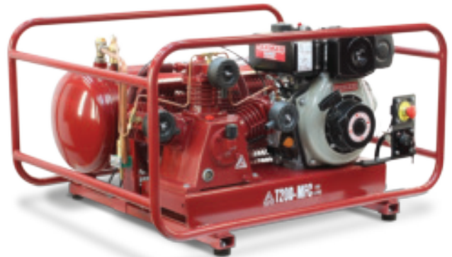
T20D MFC ES - 4.7 hp / 60 L