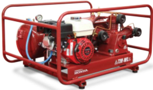
T20P MFC - 6.5 hp / 60 L