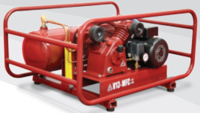
V13 MFC 240V - 2.2 hp / 40 L

The standard roll frame setup is easy to handle and protects the unit against knocks. It can be readily changed to unitary skid-mounted layout for ease of installation on a service vehicle if required. Or it can be further converted into a two-piece skid-mounted layout to suit remote air tank installation.