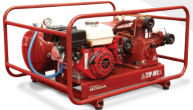
T20P MFC ES - 6.5 hp / 60 L