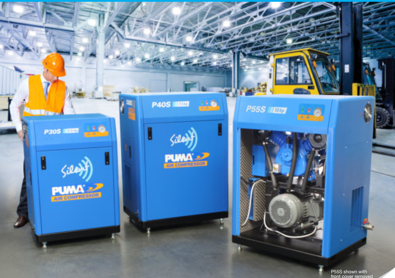
P55S shown with front cover removed