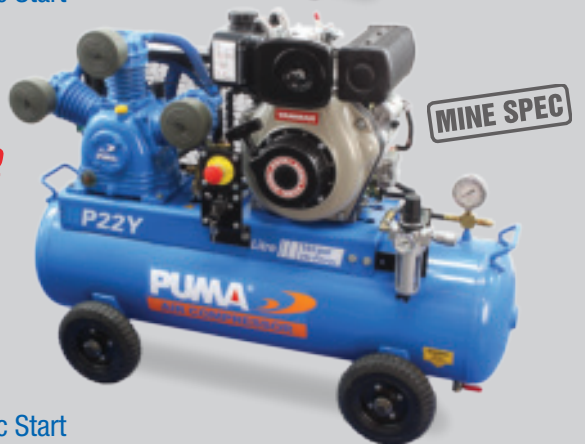
P22Y Electric Start