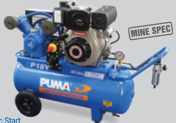
P18Y Electric Start