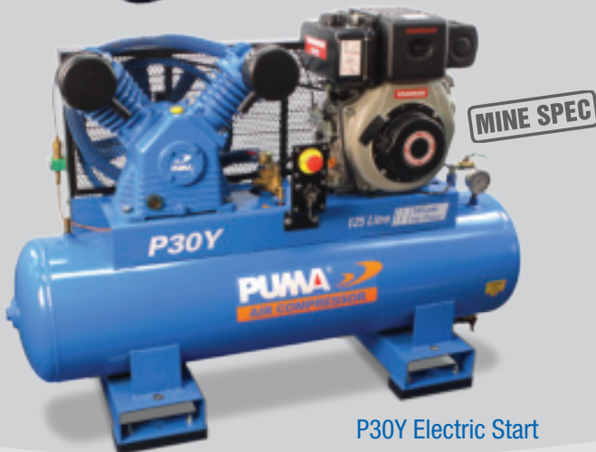
P30Y Electric Start