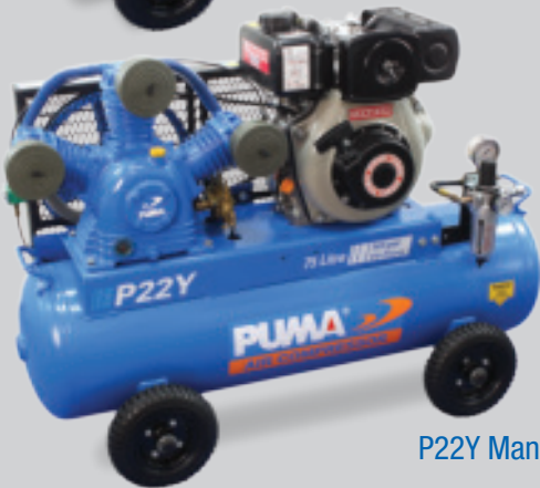
P22Y Manual Start