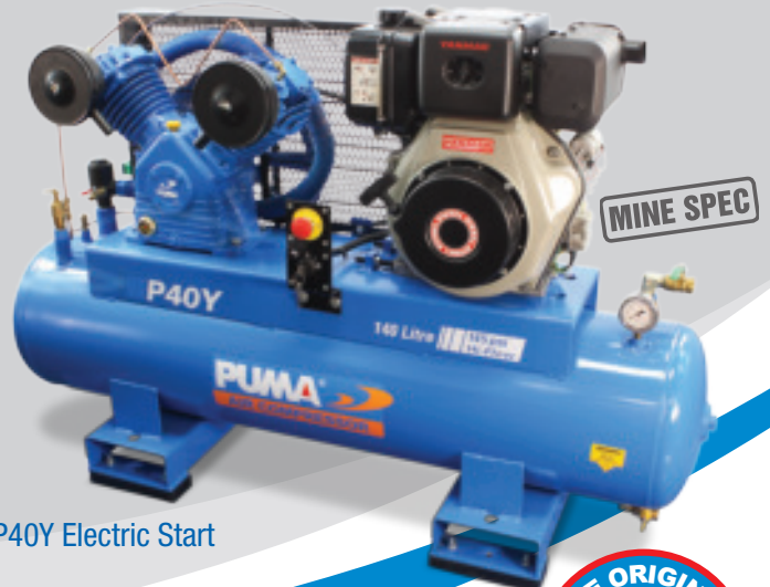
P40Y Electric Start