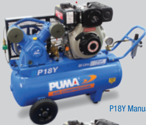
P18Y Manual Start