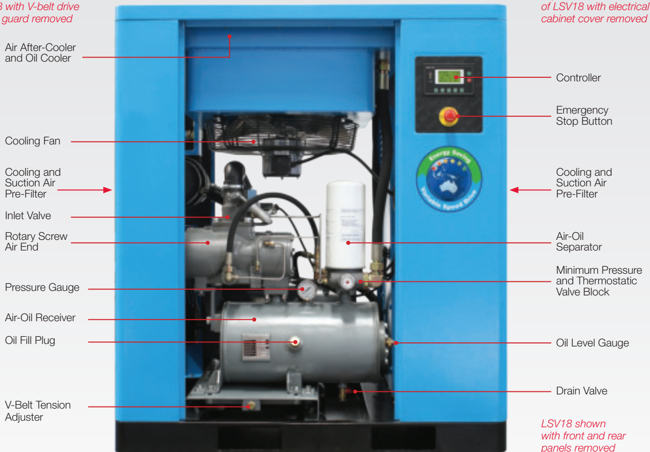
Right side internal view of LSV18 with electrical cabinet cover removed