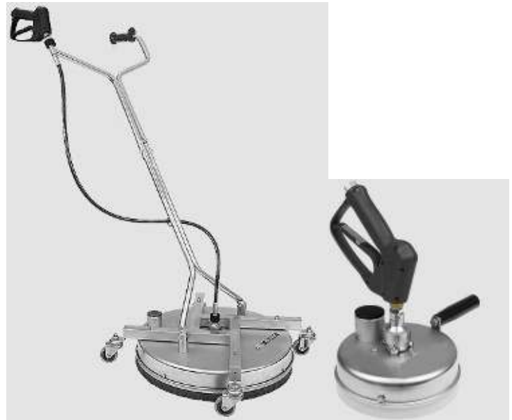
Mosmatic Vacuum Surface Cleaners

Hydromat Pump Out vacuum cleaners are particularly effective in Water recycling of Outdoor and indoor surface cleaning, for the suction of Water from Construction Sites and Applications where no indoor Drain is available. Sensibly priced to suit the tightest budget, Hydromat vacuum cleaners are built tough to last, and feature full service, 2 year warranty and Australia-wide spare parts back-up.